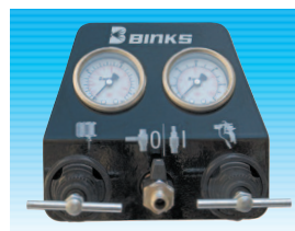
Easy to use controls