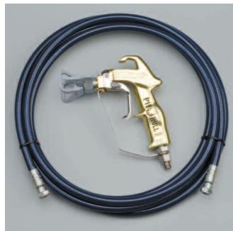
Part No: A7500-2-75 gun, hose and twist tip package (no tip)