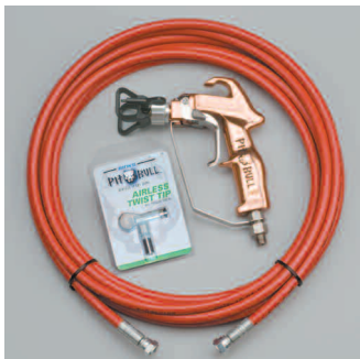
Part No: A3500-2-75 gun, hose and twist tip package (inc. tip)